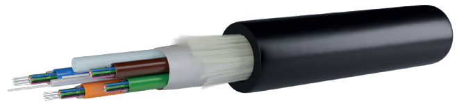
Demonstrative cable of 48 fibers.