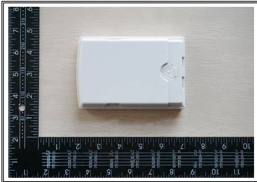
Test item: Fiber Box