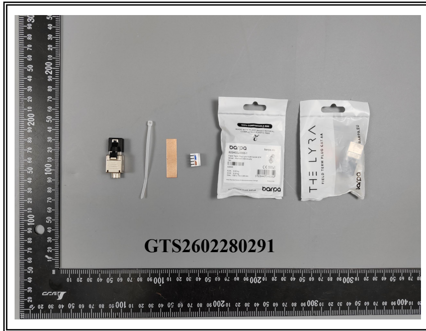
Sample Name : Field Term Plug Lyra RJ45 Cat.6A STP