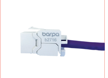
Close the cable tie.