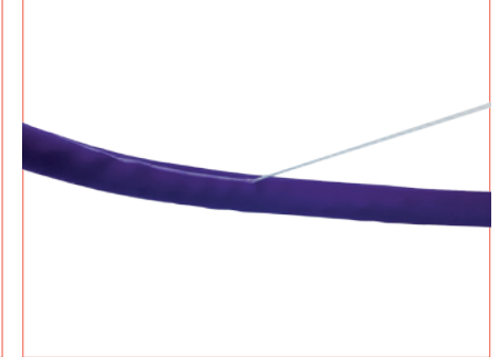
1 Cut the cable and pull the ripcord.