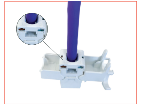
Follow the arrows for orientation.