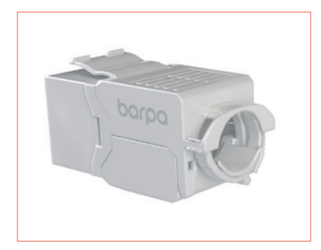
MODELS: CAT6A UTP & CAT6 UTP