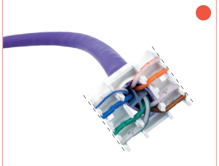
6 Cut flush.