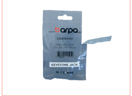
Open the blister.