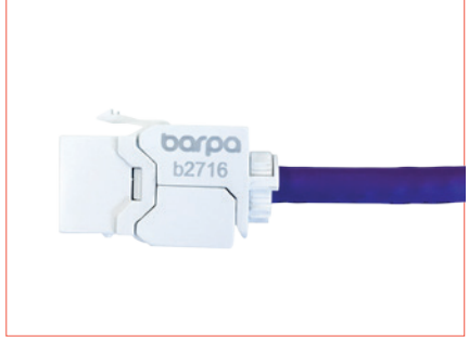
1 O DONE! GOOD JOB!