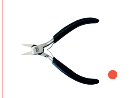
When you see orange symbol means that you need this tool.