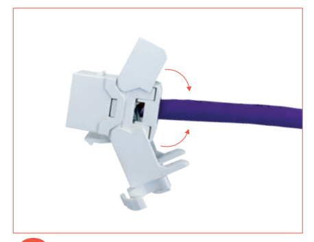
Close to make the conection.