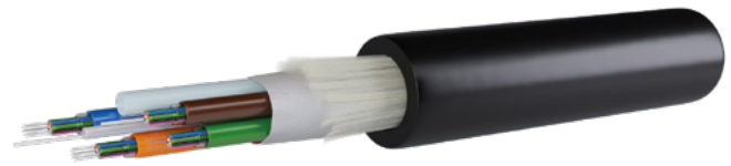
Demonstrative cable of 48 fibers.